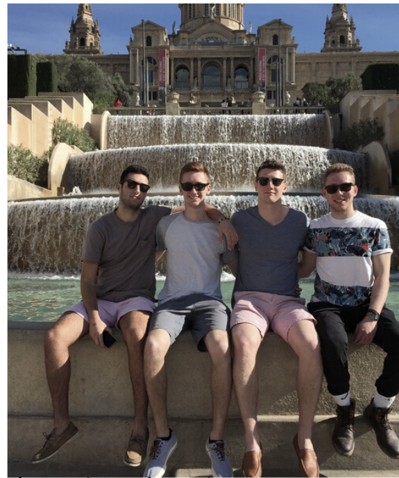
Barcelona, Spain