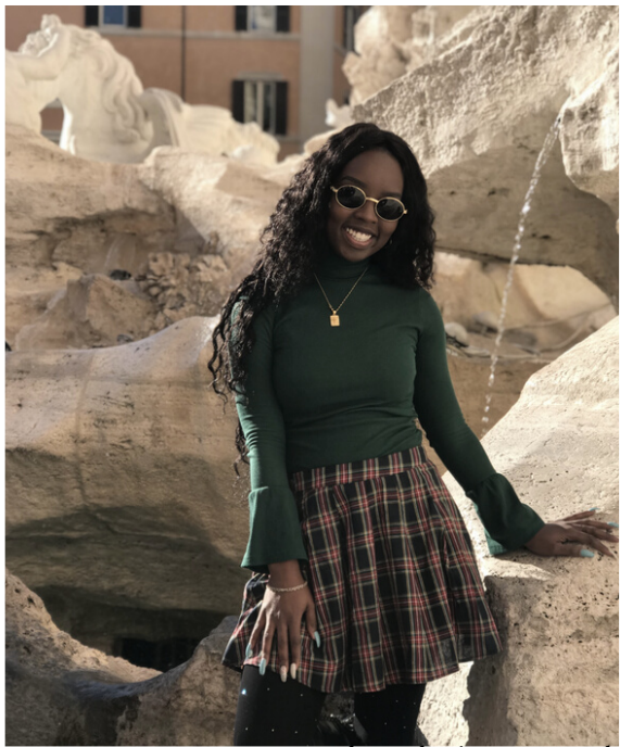
Rome, Italy