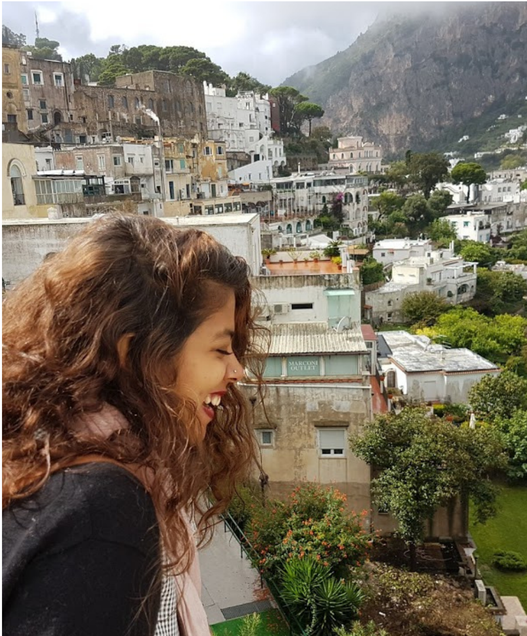
Sorrento, Italy