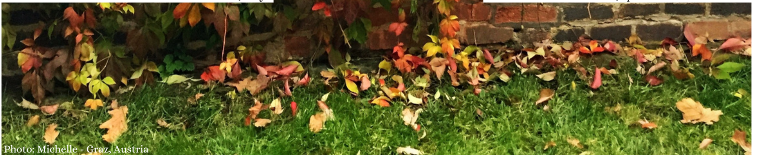
Graz, Austria